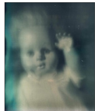
'Dolly says bye bye' (Fresnal lens image).

*Light sensitive photographic paper is not the photographic paper used in ink jet printers. For more paper negative info see Joe Van Cleaves videos, one of the few people experimenting with this technique.